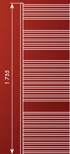
DXQU 1755 0600...